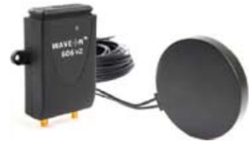
WaveOn 606 v2 Mobile Data Acquisition